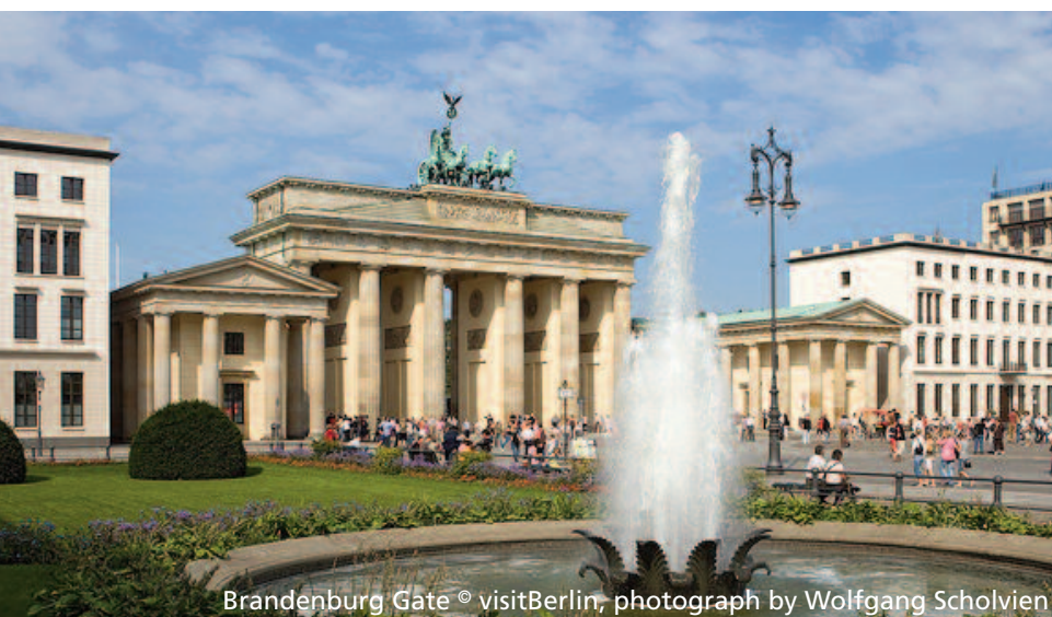
Brandenburg Gate